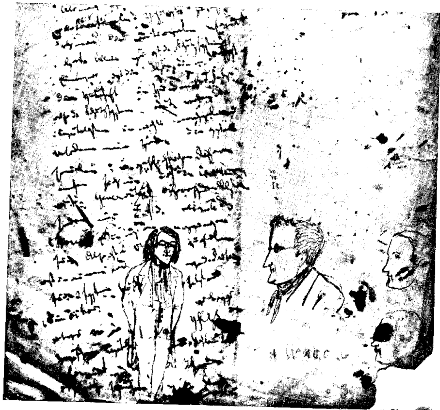
Bottom of the page from Marx's manuscript, "Protectionists", with drawings by Engels