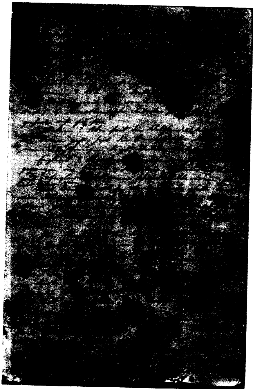
First page of Engels' travel notes "From Paris to Berne"